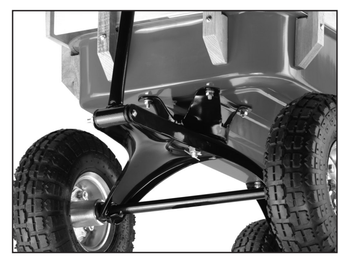
Figure 2. Steering bracket and front axle assembly mounted to the bed.